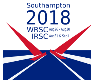
Figure 3: Sample PNG figure